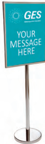
22" W X 28" H Chrome Sign Holder (sign extra)