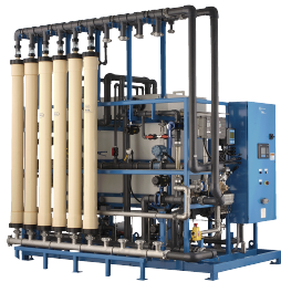
Pall Microfiltration and Reverse Osmosis Membrane Treatment