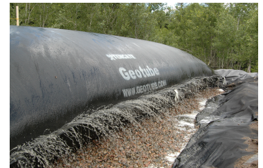
BioCord Lagoon Treatment and Geotube Sludge Management