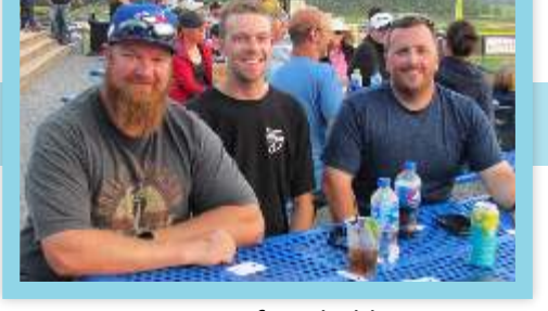
Town of Penhold